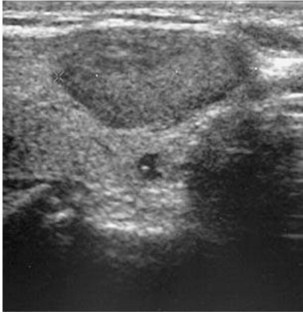
Figure 3. Cross-Sectional Ultrasonogram Showing a Solid, Hypoechoic Nodule (Dark Gray) in the Right Thyroid Lobe.